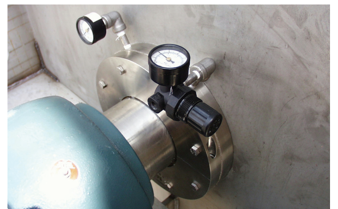
Inpro/Seal shaft mounting with air kit; commercial SS mixer