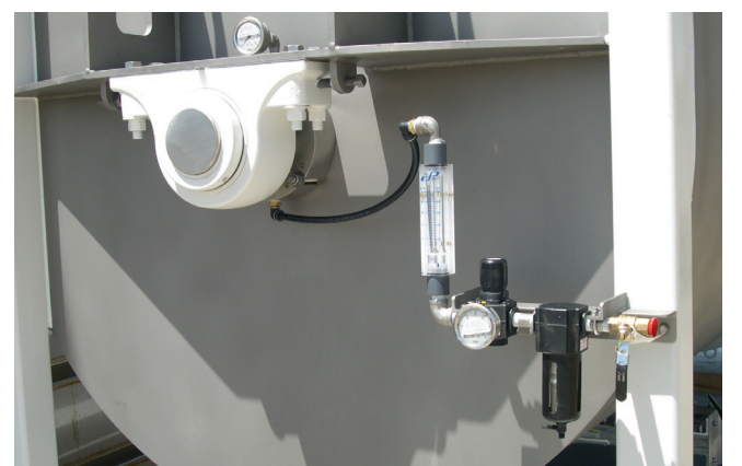
Commercial SS mixer with Inpro/Seal air kit mounted