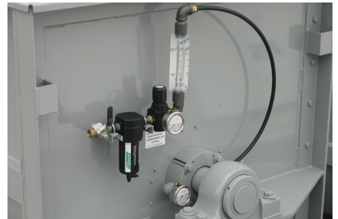
Dry concrete mixer with Inpro/Seal air kit mounted for connection